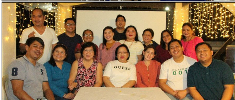
In Pictures: (Top) Day 1 at the OCC Auditorium; (Bottom) Days 2 and 3 at Tagaytay Farmhills

OCC conducted a 3-day strategic planning and workshop to develop and refine the strategic goals and future initiatives of the institution. The college officials, administrative staffs, and selected faculty members participated in this event.