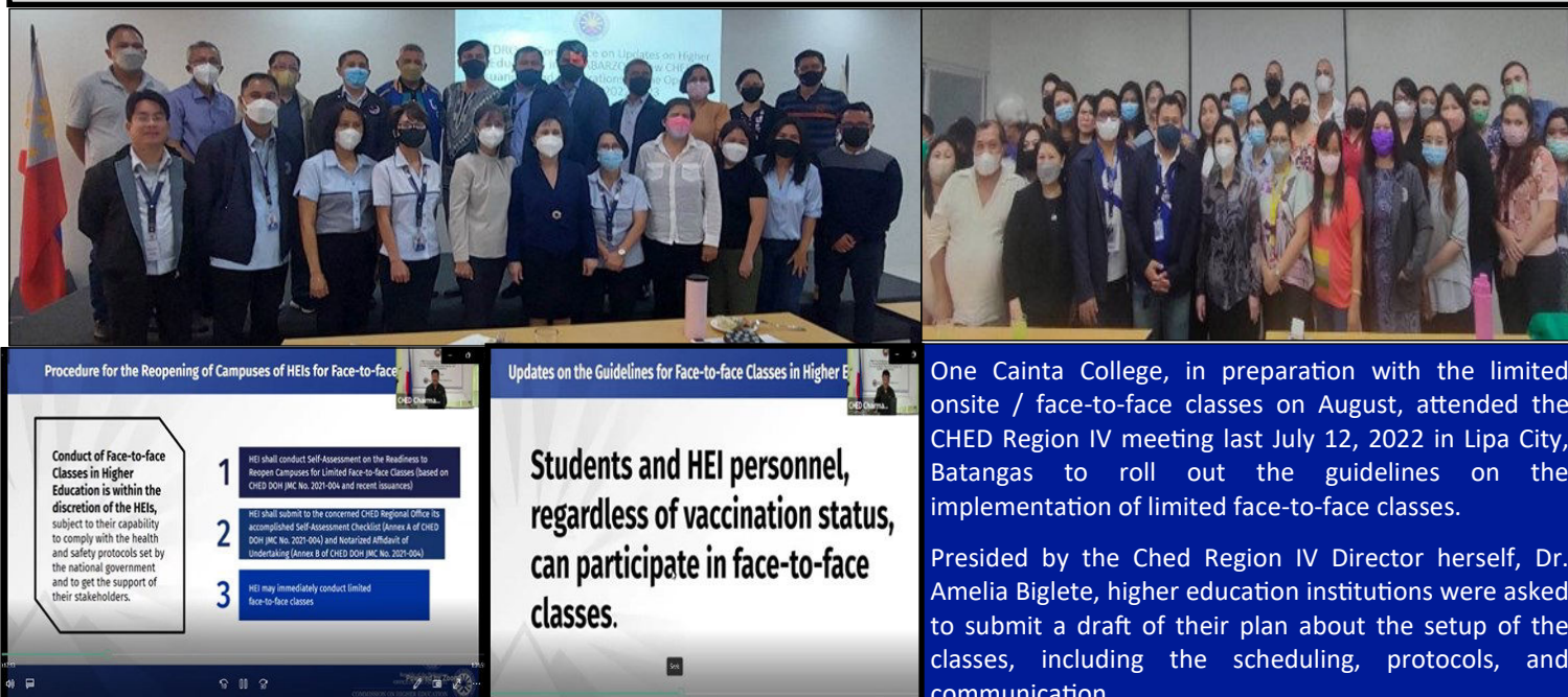
In pictures: (Top) 1. Meeting on Guidelines for Limited Face-to-Face Classes, 2. Meeting of CALABARZON Registrars; (Bottom) Online Meeting and Press Conference of CHED Updated Guidelines on Limited Face-to-Face Classes

One Cainta College, in preparation with the limited onsite / face-to-face classes on August, attended the CHED Region IV meeting last July 12, 2022 in Lipa City, Batangas to roll out the guidelines on the implementation of limited face-to-face classes.