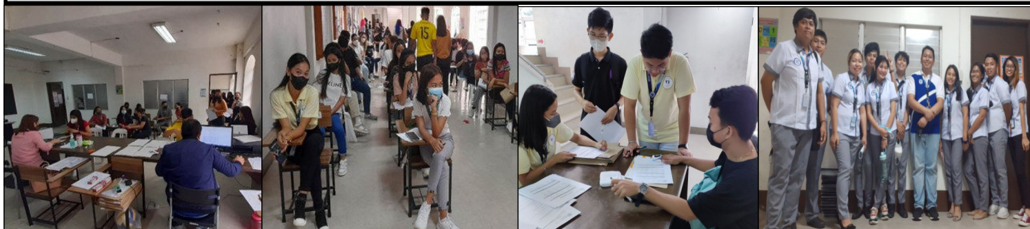
In Pictures : Faculty, admin staff, and student societies in action during the admission and enrolment to ensure smoother enrolment work flow.

The “back-to-school” experience was real as over 1,800 students from freshmen to seniors went to the campus for the face-to-face enrolment for the 1st Semester of AY 2022-2023. The courses and year levels were divided according to schedules between August 1—15, 2022, except for the freshman and transferees who enrolled anytime on the said dates. It was all-hands-on-deck for all the full time faculty and administrative staffs, and with the help of the student societies (Educators’ Society, Entrepreneurs’ Society, and BSIS Student Society), the enrolment flow was smooth and successful.